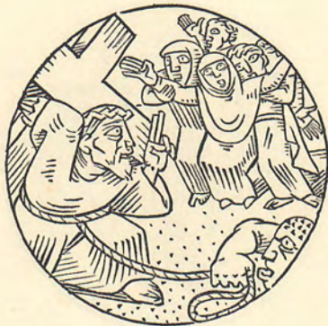
JESUS MEETS HIS MOTHER