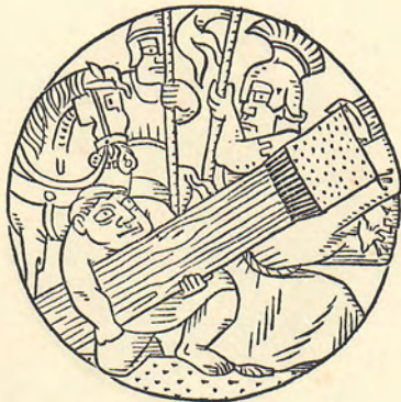
SIMON HELPS JESUS CARRY THE CROSS