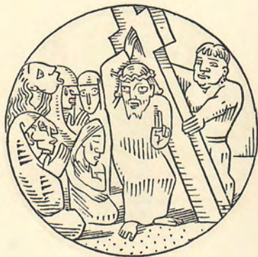
JESUS SPEAKS TO THE WOMEN OF JERUSALEM