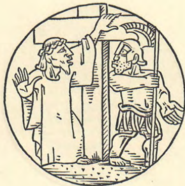
JESUS RECEIVES HIS CROSS