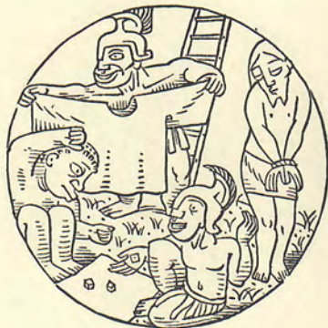
JESUS IS STRIPPED OF HIS GARMENTS