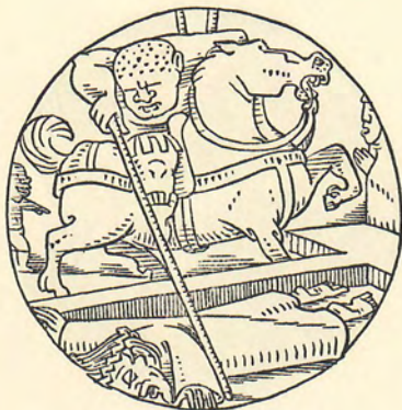
JESUS FALLS THE THIRD TIME