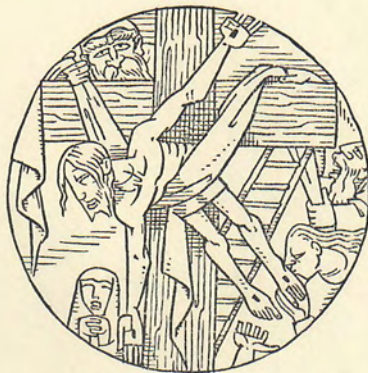
JESUS IS TAKEN DOWN FROM THE CROSS