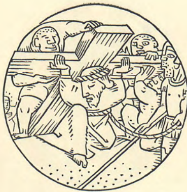
JESUS FALLS THE FIRST TIME