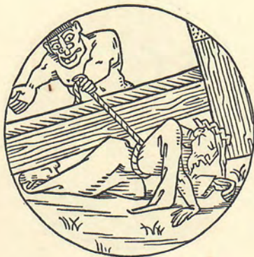
JESUS FALLS THE SECOND TIME