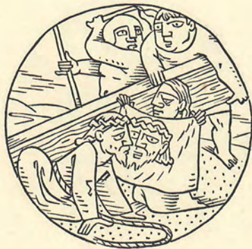
VERONICA WIPES THE FACE OF JESUS