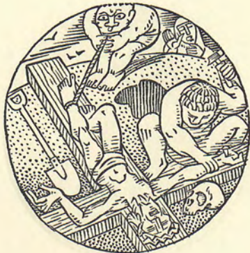
JESUS IS NAILED TO THE CROSS